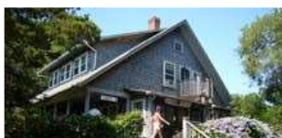
SOMETHING NATURAL nantucket