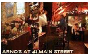
ARNO'S AT 41 MAIN STREET

15 Teasdale Circle, Nantucket ~ (800) 432-1673 ~ www.nantucketcoffee.com