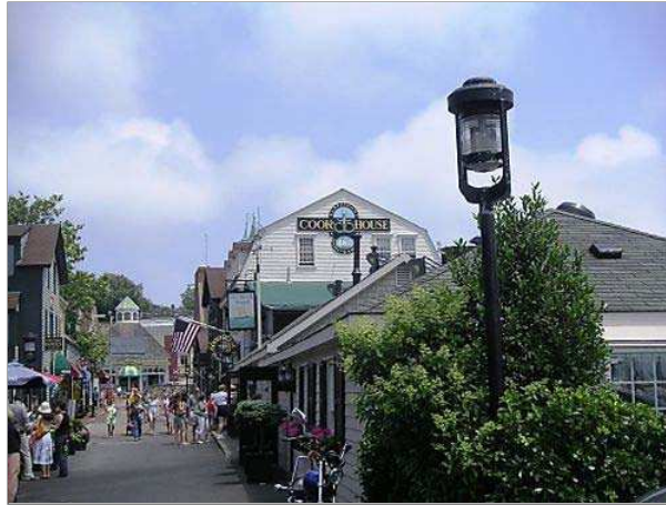
Shopping in Nantucket Wharf