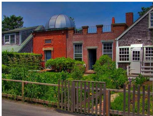
Maria Mitchell Observatory

On a night in October of 1847, a woman stood on the roof of the Pacific National Bank near her Nantucket home with a telescope. This was nothing new as Maria Mitchell had, since childhood, had a love for astronomy. At age 12, she and her father had pinpointed the location of their Nantucket home by observing a solar eclipse. So adept was Maria at astronomy that whaling captains trusted her to plot the navigation for their whaling journeys. Throughout her young womanhood, she acquired astronomical equipment and conducted observations.