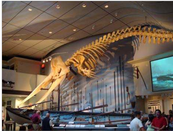
Nantucket Whaling Museum